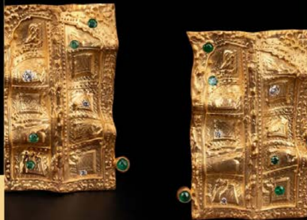
Emerald Diamond Door Earrings