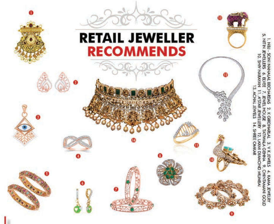
1. NIBI SONI NANAKI BECHARDAS 2. K. GOPHALLA 3. V. K. KAPRE 4. KAMA BIREY 5. NININ JEWELLERS 6. EWE 7. JENNY HOUSE 8. TATIWALA GEHNA 9. CHINTAMANI GOLD 10. SHIV NARAYAN 11. ASHAP JEWELLER 12. LUVI DIAMOND MUMBAI 13. ACHAL JEWELS 14. SHREE OMKAR